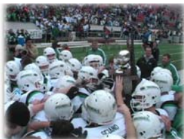
The Panthers holding up the silver ball at State.

On November 17th, the gridiron Panthers of Greendale made a trip about 80 miles west... to Madison. Following a defensive battle, the Panthers wound up on the losing side of a 7-3 decision. While silver will never be mistaken for gold, dozens of positives