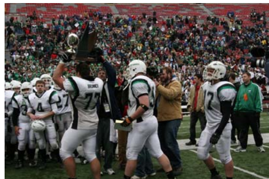
The 2006 WIAA Division 3 State Runner-up Greendale Panthers and their trophy

Along the way, a third consecutive conference title would mark the first time since the Cudahy teams of the mid-1990’s have accomplished that feat.